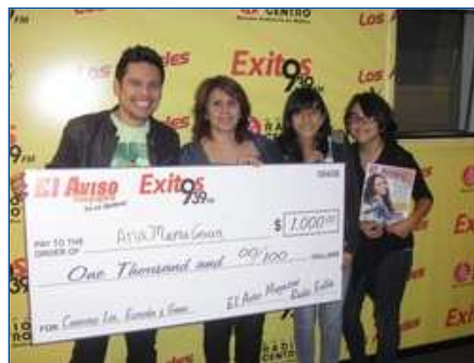
$1,000 jackpot lucky winner with El Aviso Futbol Fantastico Contest

Santa Clarita, Calif. May 26, 2010 -- Mexican immigrants to the United States don't always make it to the front cover of mainstream news media for the right reasons, so a small business venture which began making waves in the Hispanic community with its own news as "El Aviso" 23 years ago - is drawing attention in its newest venue on the air waves with a 14-week on-air promotion, "Futbol Fantastico," in conjunction with broadcast reports on soccer in South Africa.