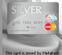
This card is issued by MetaBank.

Sign Up for a SilverCard Prepaid MasterCard®