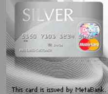
This card is issued by MetaBank.

Sign Up for a SilverCard Prepaid MasterCard®