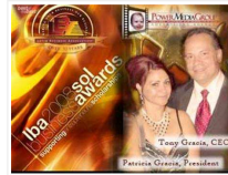
Power Media Group Inc. - a thriving Hispanic-owned advertising agency skillful in building relationships and brands with the Hispanic consumers