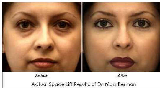
Facial Fat Grafting (Space Lift) Due to Lack of Cheek Fat

"Baby Boomers might look 50 or 60 on the outside, but we're still 25 on the inside," stated Berman. "We want to look the way we think we look." Dr. Berman points to a 2009 AACs Procedural Census Fact Sheet released this month that indicates the increase marked a 9 percent increase among women and 2 percent increase among men.