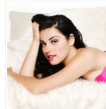
Maite Perroni- Lips